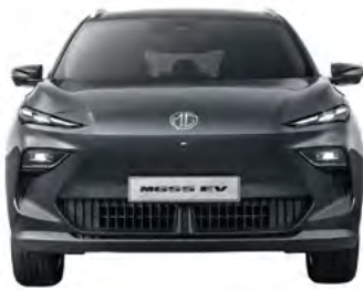
FRONT TRACK 1,554MM