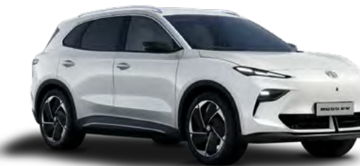
○ ARCTIC WHITE SOLID PAINT