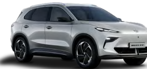
○ COSMIC SILVER METALLIC PAINT*

*Metallic paint optional at extra cost. Gloss Black door mirrors standard on all exterior colours.