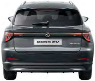
REAR TRACK 1,561MM