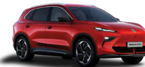
● DYNAMIC RED METALLIC PAINT*