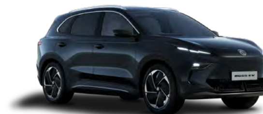
● BLACK PEARL METALLIC PAINT*