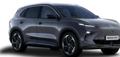
● URBAN GREY METALLIC PAINT*