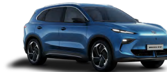
● ELECTRIC BLUE METALLIC PAINT*