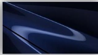
Deep Crystal Blue (42M)