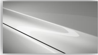
Arctic White Solid (A4D)

• = Available; o = Available at an additional cost.