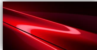
Soul Red Crystal Metallic (46V)