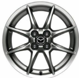
16" Bright Silver Alloy