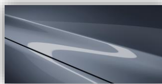
Polymetal Grey Metallic (47C)