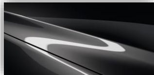
Machine Grey Metallic (46G)