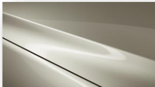
Platinum Quartz (47S)