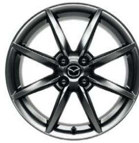
17" Bright Silver Alloy (184ps only)