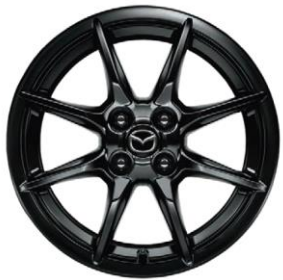
16" Black Metallic Alloy