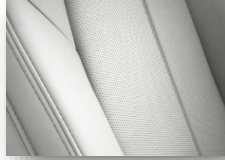
Stone Nappa Leather