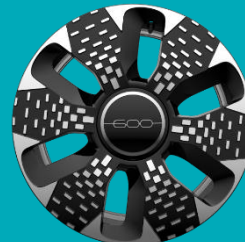
La Prima Standard Wheel 18" Alloy Wheels Diamond Cut