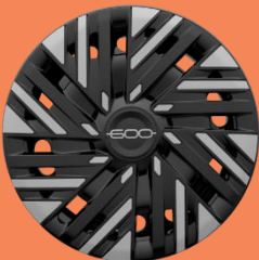
Standard Wheel 16” Steel Wheels with Covers