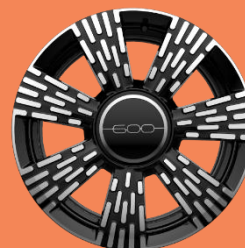
Standard Wheel 17" Alloy Wheels Diamond Cut