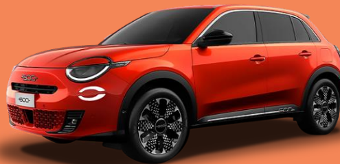
Orange - Sun