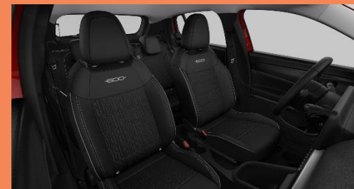
Standard Upholstery Black Recycled Fabric Seat Upholstery with Fiat Monogram