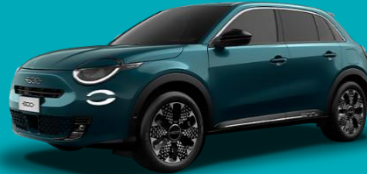
Green - Sea