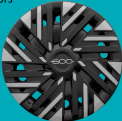
(RED) Standard Wheel 16" Steel Wheels with Covers