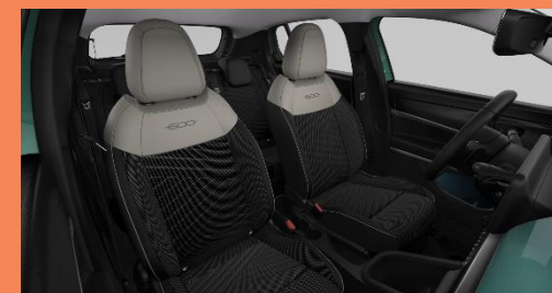
Black & Ivory Recycled Fabric Seat Upholstery with Fiat Monogram