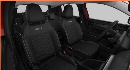
Standard Upholstery Black Recycled Fabric Seat Upholstery with Fiat Monogram

All pictures for illustration purposes only