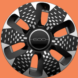
Standard Wheel 18" Alloy Wheels Diamond Cut