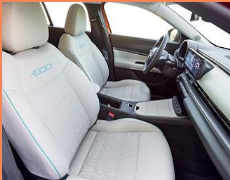
Standard Upholstery Full Ivory Fiat Monogram Leather Seat Upholstery

All pictures for illustration purposes only