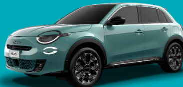
Blue - Sky